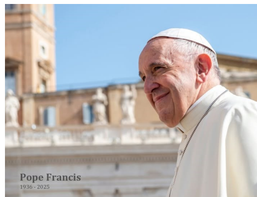
Pope Francis 1936 - 2025

All are welcome to take a moment to offer their respects.